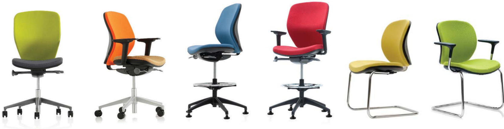
Code. JOY - 01 Swivel Task Chair Code. JOY - 02 Swivel Task Arm Chair Code. JOY - 03 Counter Chair Code. JOY - 04 Counter Arm Chair Code. JOY - 05 Visitor Chair Code. JOY - 06 Visitor Arm Chair 930mm H / 630mm D / 660mm W 930mm H / 630mm D / 660mm W 1050mm H / 630mm D / 660mm W 1050mm H / 630mm D / 660mm W 860mm H / 560mm D / 560mm W 860mm H / 560mm D / 560mm W