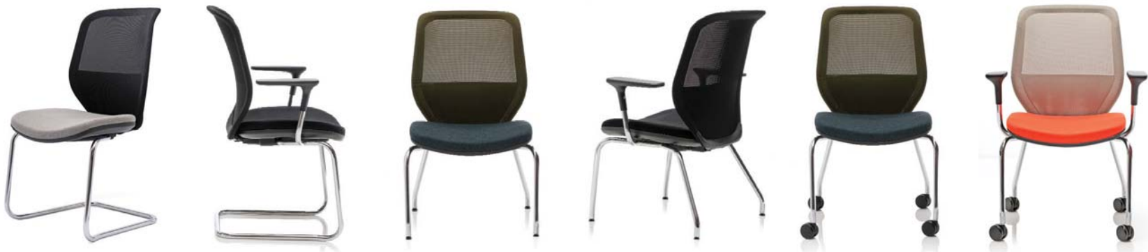
Code. JOY - 13 Mesh Back Cantilever Chair Code. JOY - 14 Mesh Back Cantilever Arm Chair Code. JOY - 15 Mesh Back 4 Leg Chair on Glides Code. JOY - 16 Mesh Back 4 Leg Arm Chair on Glides Code. JOY - 17 Mesh Back 4 Leg Chair on Castors Code. JOY - 18 Mesh Back 4 Leg Arm Chair on Castors 950mm H / 560mm D / 520mm W 950mm H / 560mm D / 660mm W 950mm H / 560mm D / 520mm W 950mm H / 560mm D / 660mm W 950mm H / 560mm D / 520mm W 950mm H / 560mm D / 660mm W

mesh back colour options: black / stone / slate grey / moss green / mushroom / fire red /