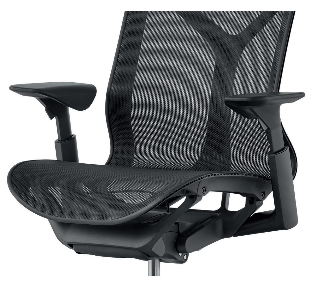
"You should have a chair that allows you to change postures as easily as possible," the designers say. "You can only do that with a chair that is correctly adjusted, so we wanted to build a chair that does that part for you."